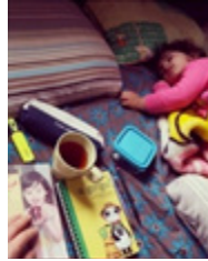
Figure 5. A participant from the second group has published an image in which her child is sitting next to the books and university stuff showing a combination of different roles.

For working, single women, work is the focus of daily activities even while studying. They do not have a particular task, and their job is the most important element that has given them identity. These women are interested in introducing themselves with their profession and record their moments while working.