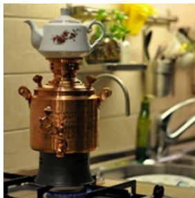
Figure 1. A participant from the eighth group loves publishing photos from the kitchen. She has higher education and also enjoys housework and presents it in different ways.

In contrast to images of men's cooperation, many women are also interested in considering the kitchen and their own appliances as specific to themselves and assume housekeeping as their own duty: "When your kitchen is shining clean". This picture is more prevalent among the housewives (with any level of education). They do not work outside the house and consider housekeeping their main job. Although many of them have high educational degrees and even introduce themselves with their discipline and expertise, being unemployed has caused them to have stronger feelings of ownership of home spaces and a greater sense of personal responsibility for domestic duties.