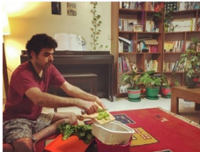
Figure 4. The man is doing a house chore which is considered one of the most feminine works to do and creates a very unfamiliar scene. As mentioned in the caption, he is then going to cook.

One of the most popular activities among working women is to portray the participation of the spouse in the home tasks and show the division of labor. Employed women want to display and promote equal rights with their husbands. The most serious and outstanding cases can be seen in the profiles of women who have higher education, expect more equality in rights and want others to see that they are breaking the stereotypes. Employed, married women with higher education are more likely to display men's cooperation at home.