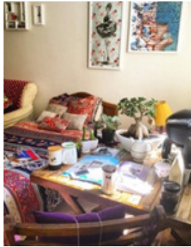
Figure 2. A participant from the fifth group shows her room with coffee making accessories ready. She doesn't even leave the room for coffee. Objects of work and university are on the table presenting her multiple tasks.

other environments that women introduce as the source of relaxation. In many profiles, women use phrases such as “cozy corner” or “my peaceful corner” and depict a spot in their house or room. For the singles, this corner is often a part of the personal room.