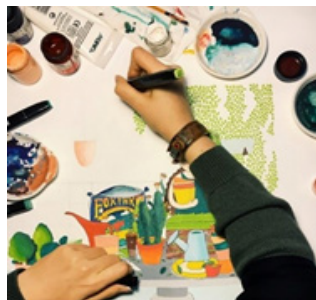
Figure 3. A participant from the third group loves colors and drawing accessories are present in all her photos. We see a close-up of her private moment in her own room.

Of the 32 users whose pages were studied, 22 showed more interest in the close-up shots and more personalized spaces, and 10 people published more wide pictures.