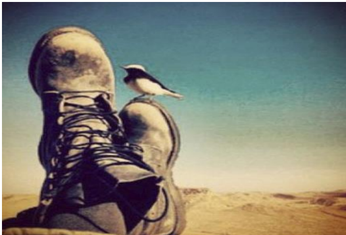
Figure 8. A photograph shared on Instagram by the Israeli Ministry of Defense entitled "Army and Peace". This photo is an example of an Instagram image that has become aesthetically ideological and political (Kohn, 2016: 208).

objects are brought together to create a narrative or simply a beautiful environment. The liking and sharing of images is perceived as approving of others' ideas. Immediate implications arising from any use of social media and the interpretation of these implications and signs, mutual commonalities, social liberty, and membership in a community incorporating new cultural trends help this app and its websites to be a sample of social media stereotype. The semiotic norms of social media primarily appear in the visual representations of the self, and in this regard Instagram contains the highest number of semiotic interpretations.